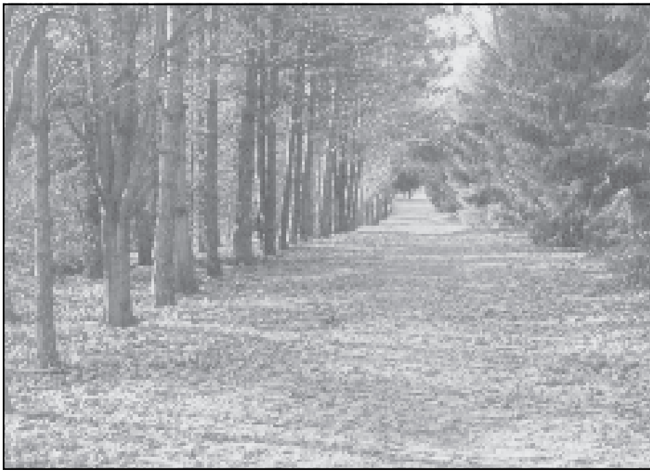
PEDESTRIAN WALKWAY - The Village of Lansing Greenway Committee has developed a network of tranquil footpaths. This one runs between Lansing West apartments and the Highgate Circle area.