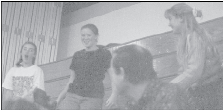
BOOGIE IN THE STANDS - The JV Ladycats' fancy floorwork inspires PDA (Public Displays of Admiration) from our normally reserved scholars. Yo!!