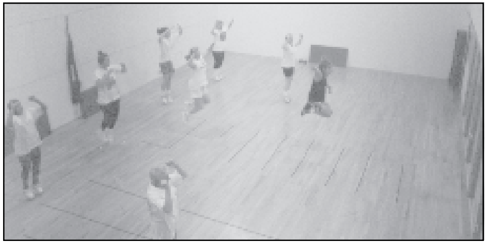
JUMP - Aerobics classes at the Eastlake Rec. Club attract Lansingites of all ages.