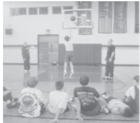
CONCENTRATION was the name of the game for nearly 90 boys and girls from Tompkins County who came to Lansing on Saturday to participate in the 25 th Elks "Hoop Shoot" contest. We look forward to their return next year.