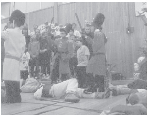
MARCH OF THE TOY SOLDIERS - Good triumphs over evil as the Nutcracker's toy soldiers duel until they overcome the nefarious Mouse King and his minions of ravaging rodents.