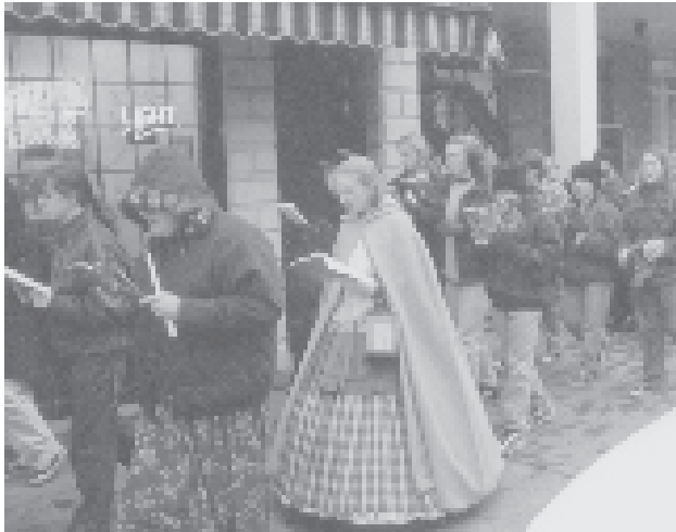
CHRISTMAS IN AURORA - December 14 was a daylong festival of theater, ice-sculpting, candlemaking, storytelling, dancing and magic shows. Here, Wells College students and local residents join for traditional caroling on Main Street.