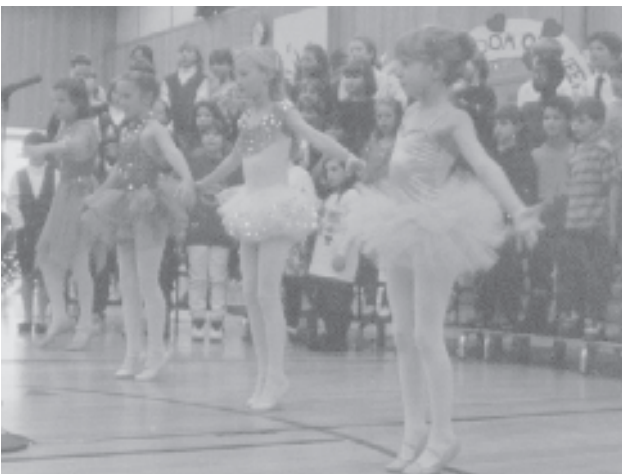
SUGAR PLUM FAIRIES have been dancing to the strains of Tchaikovsky's Nutcracker Suite for 105 years. The master would be happy to see it in Lansing.