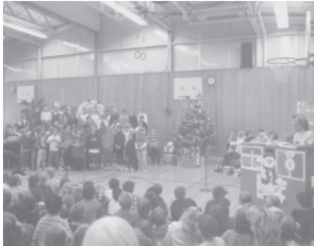
EVERYONE PARTICIPATED at the December 20 Elementary School Program. In addition to dancing and singing traditional Christmas songs, parents and students heard the "Nigerian Boat Song" honoring the African-American harvest festival of Kwanza.