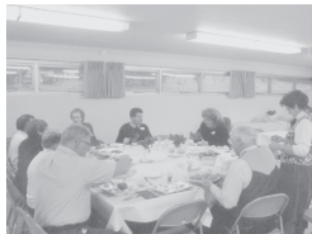
THEY WHO SERVE ALSO WAIT - Now that their guests have gone to post-banquet entertainment, the church's volunteer waiters enjoy the holiday fare.