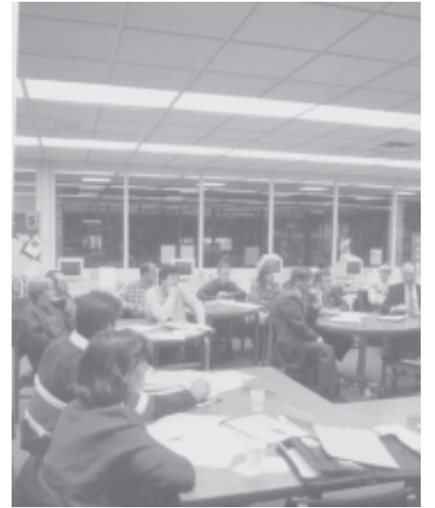
PUBLIC INPUT is always sought at the beginning of every Board meeting.