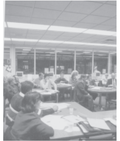
PUBLIC INPUT is always sought at the beginning of every Board meeting.